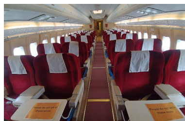
Second class seats for the servants

A wonderful museum well worth a visit. A great day out and the weather made it even better.