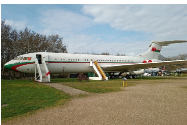
Sultan of Oman's Plane

Some of the group had a guided tour through the Concorde aircraft that was on display there whilst others did some more wandering.