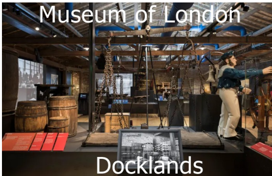
Museum of London