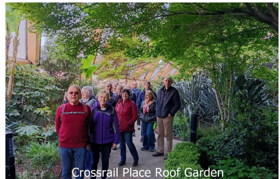
Crossrail Place Roof Garden

As we have some time to spare we walked around Canary Wharf, the Crossrail roof garden and Jubilee Park, a quiet oasis in the bustle of the wharf.