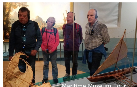
Maritime Museum Tour

There is so much to do at Greenwich – Maritime Museum, special exhibits within the museum, the Observatory, the Cutty Sark plus some lovely walks. Maybe we should go again one day?