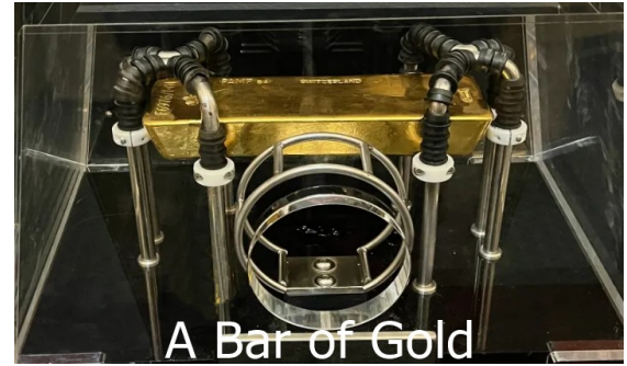
A Bar of Gold

Wharf where we had lunch and then walked around the Museum of London Docklands. This is quite a small but interesting museum.