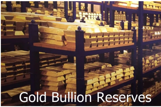
Gold Bullion Reserves

Beneath the bank there is a vault with huge gold reserves, the bank store it there for other countries. Of course we had to have a go at lifting a gold bar which is deceptively heavy.